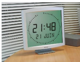
Cristalys Ellipse on table support

The NTP server must have a transmission (Poll) period of less than 128 seconds.