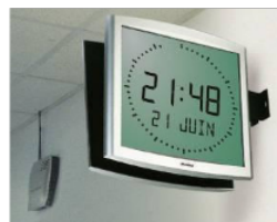
Cristalys Ellipse on double sided bracket