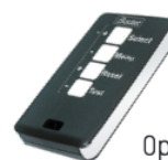
Option: wireless remote control