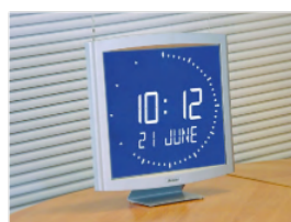
Opalys Ellipse on table support