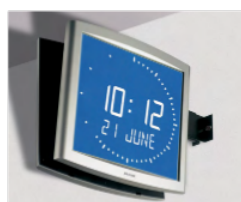
Opalys Ellipse on double-sided bracket