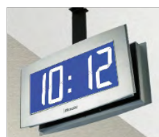
Opalys 14 on double-sided bracket