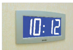
Opalys 14 recessed mounting

The NTP server must have a transmission (Poll) period of less than 128 seconds.