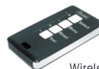
Wireless remote control