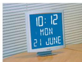
Opalys date on table support