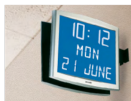
Opalys date on double-sided bracket