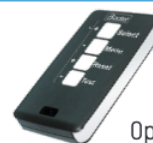
Option: wireless remote control