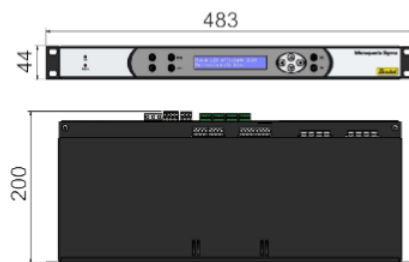
Weight: 1.4 Kg